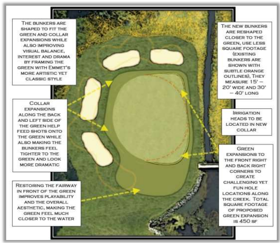
The Powelton Club's 16th hole plans

Founded in 1882, The Powelton Club is one of the oldest clubs in the United States, and its 1926 Devereaux Emmet designed course exudes many of the best qualities of classic Golden Age Golf Architecture: sporty, challenging, quirky, interesting, and fun. The goal of the work is to address the failing bunkers and related infrastructure, and restore the classic style and strategy of the original Emmet design.